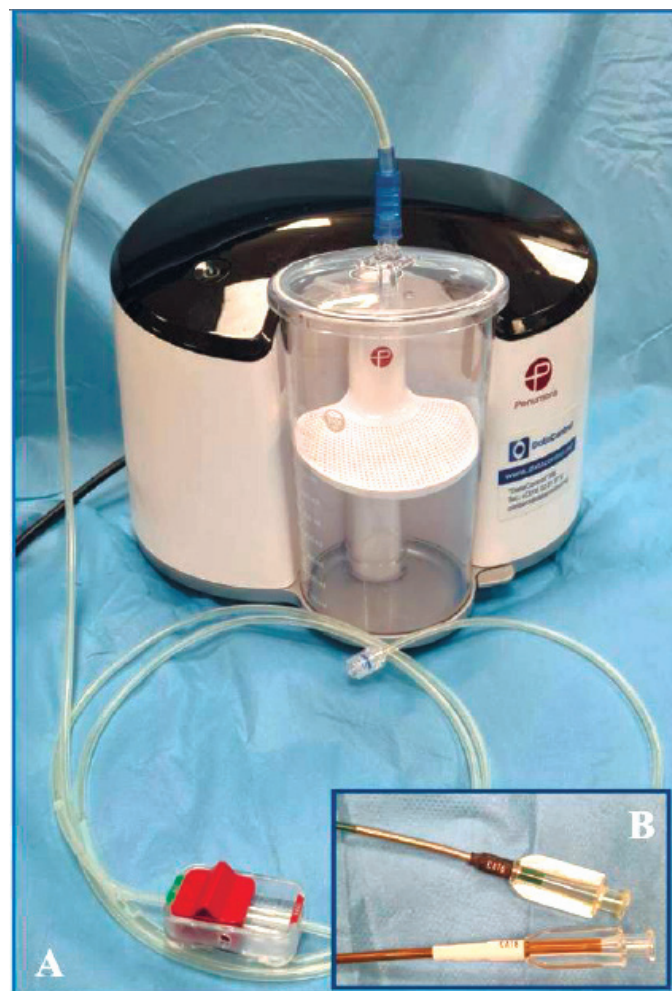
Fig. 1 General aspect of Penumbra Indigo® system (A) and the dedicated CAT6™ and CAT8™ mechanical thrombectomy catheters (B).

Technical aspects of percutaneous vacuum-assisted thromboaspiration. Following the establishment of endovascular access and the placement of a 6F or 8F sheath,